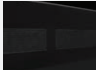
Front Vents Allow Unit to be Fully Recessed