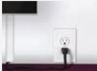
Paintable Cord Cover