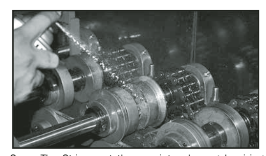
Spray The Stripper at those points where galvanizing tends to build up on your machines. The special cleaning ingredients get right to work softening up deposits.